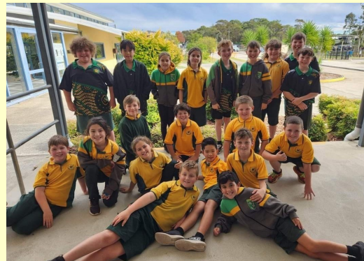
Knights of Tacoma Chess team