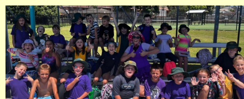
Walarah Zone Swim Team 2023