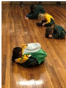
Smelling our toes