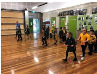
Bus stop game